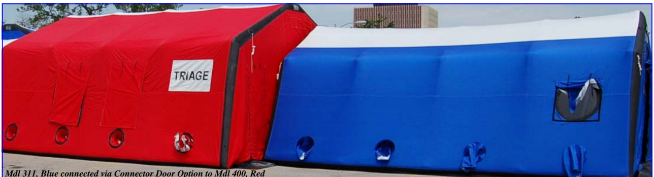
Mdl 311, Blue connected via Connector Door Option to Mdl 400, Red