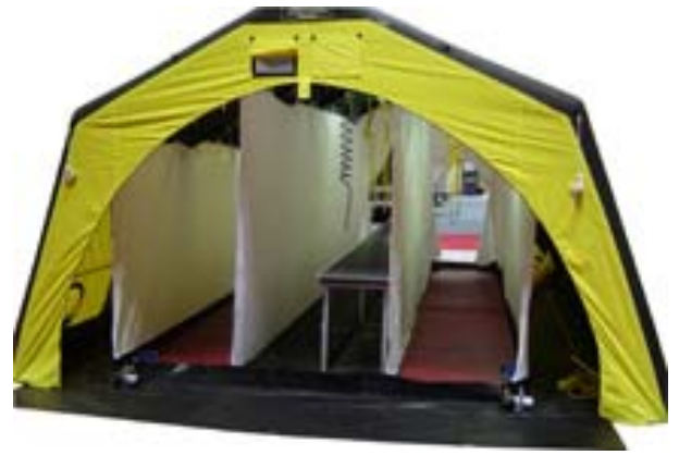
Mdl 311-L3-E, Three-Lane Decon System w/ Non-Ambulatory shown