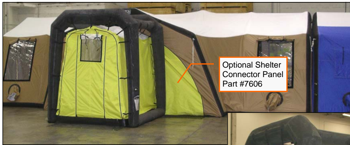
Optional Shelter Connector Panel Part #7606