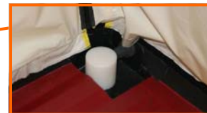
Optional Surround Rinse Hose with 4 x 1.2 GPM Nozzles, Part # 5758

Dimensions Overall: 7' L x 7' W x 7'9" H Interior Dimensions: 7' L x 5'6" W x 6.11" H Approximate Weight: 95 lbs. (with Plumbing)