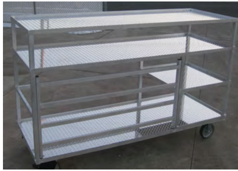
Cart 92 with Deployment Door