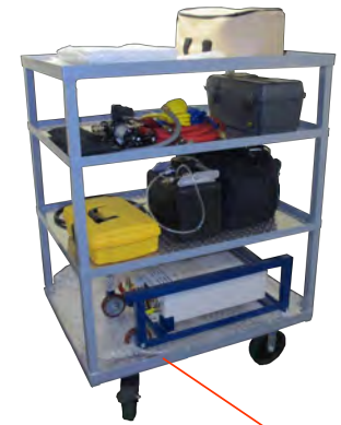
Cart 46 for Accessories