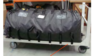
Basic Cart for Mdl 860