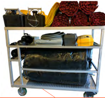
Cart 72 with Deployment Door